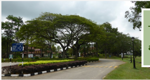
Tiara access road

The golf course at Tiara is a five-star design with inter-connecting lakes and dramatic scenery; 27 holes in total, descriptively named Lake, Meadow and Woodland.