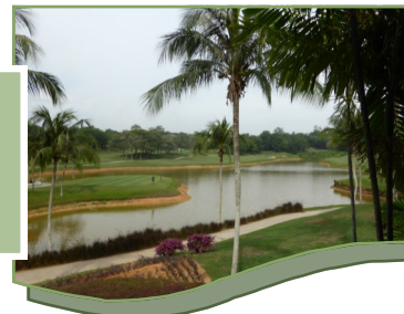
View from Golfers Terrace

Tiara is a guarded community with staff and security on site, so you can be assured of a helping hand whenever it is needed within a safer environment. It is the perfect location to live and to play.